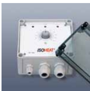
Electronic temperature regulator MiL-EC200

Other temperature regulators or capillary pipe - thermostats on request.