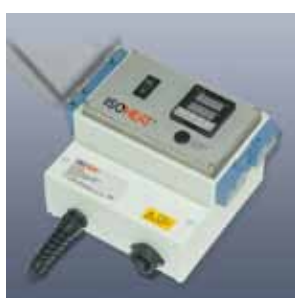
Electronic temperature regulator series MiL-RD1000