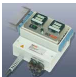
Electronic temperature regulator series MiL-RD1053