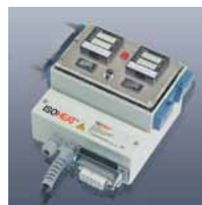
Regulator- and limiter combination MiL-RD3000

MiL Heating Systems Großer Sand 4 D-76698 Ubstadt-Weiher