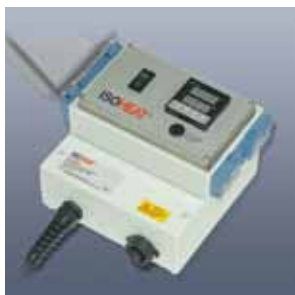
Electronic temperature regulator series MiL-RD1000