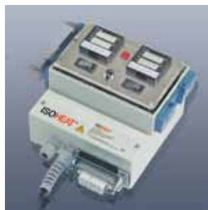
Regulator- and limiter combination MiL-RD3000