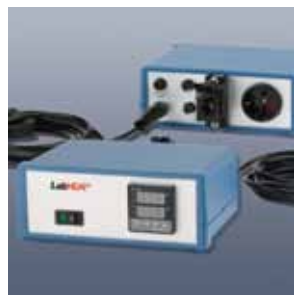
Electronic laboratory regulator series MiL-RX1000