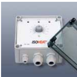
Electronic temperature regulator MiL-EC200

For temperature regulation we recommend our program of electronic control and temperature regulation appliances and corresponding temperature sensors.