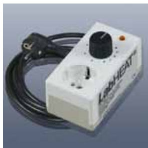
Power controller MiL-L116